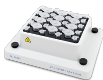
SC-18/02 BS-010120-CK block

20 × 0.2 ml microtubes + 12 × 1.5 ml microtubes