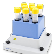
VP-8/15 BS-010175-HK block