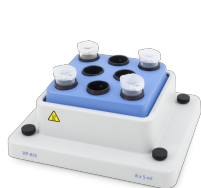
VP-8/5 BS-010175-SK block

96-well unskirted or semi- skirted microplate (0.2 ml) for PCR or 12 × 8 - 0.2ml strips or 96 tubes of 0.2 ml.