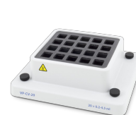
VP-CV-20 BS-010175-IK block