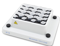
SC-18 BS-010120-AK block