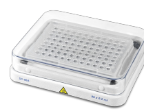
SC-96A BS-010120-FK block

96-well unskirted or semi- skirted microplate (0.2 ml) for PCR or 12 × 8 - 0.2ml strips or 96 tubes of 0.2 ml.