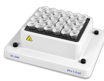
SC-24N BS-010120-GK block

20 × 0.2 ml microtubes + 12 × 1.5 ml microtubes