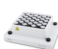
VP-32 BS-010175-JK block