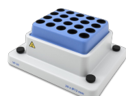
VP-20 BS-010175-TK block