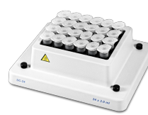
SC-24 BS-010120-EK block