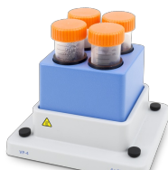
VP-4 BS-010175-GK block