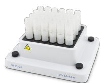
VP-CL-24 BS-010175-KK block