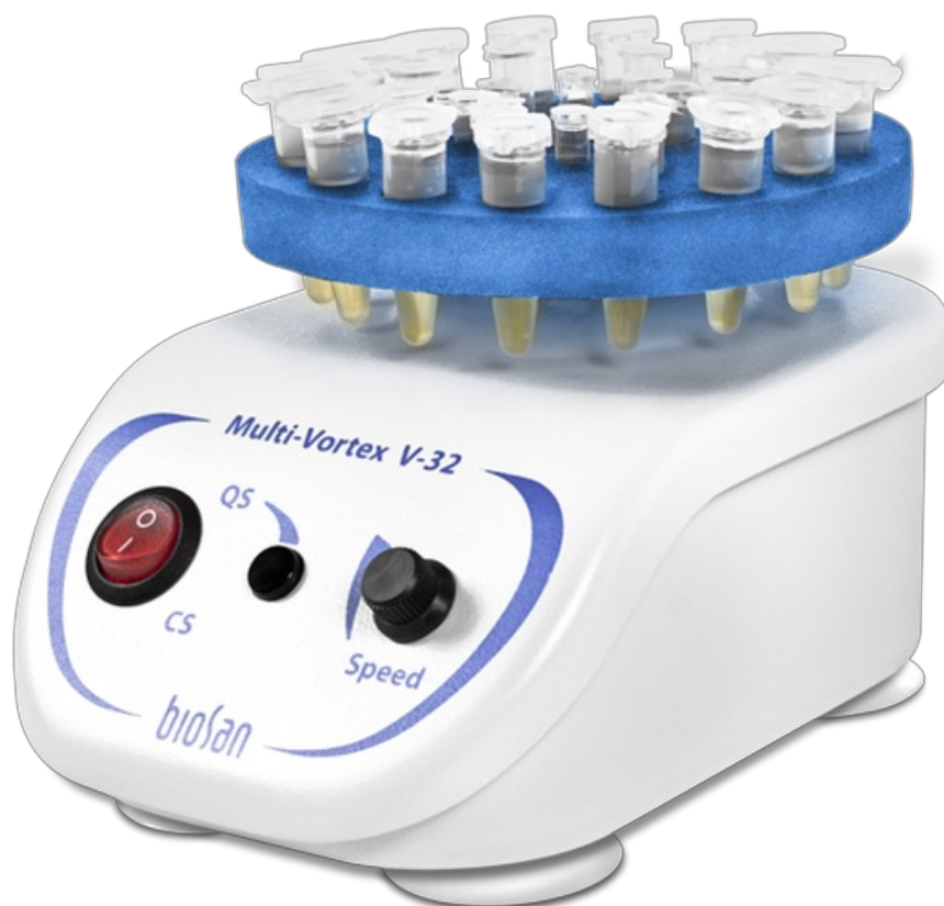
V-32 Including two platforms PV-32, PL-1 Multi-Vortex

Multi-Vortex V-32 is intended for intensive stirring of bacterial and yeast cell, washing from the culture medium and extraction of metabolites and enzymes from cells and cell cultures.