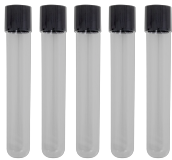
Glass test tubes 16mm BS-050102-MK

Glass Test Tubes 16x100mm, high borosilicate, PP Cap with silicone pad. Packing - 100 pcs/box