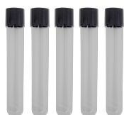
Glass test tubes 16mm BS-050102-MK

Glass Test Tubes 16x100mm, high borosilicate, PP Cap with silicone pad. Packing - 100 pcs/box