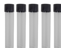
Glass test tubes 18mm BS-050102-NK

Glass Test Tubes 18x100mm, high borosilicate, PP Cap with silicone pad. Packing - 100 pcs/box