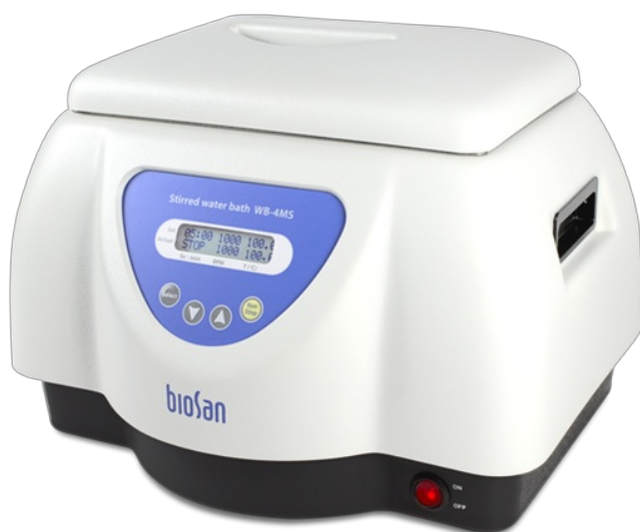
WB-4MS With base BP-1 and lid Stirred water bath

Water bath-thermostat WB-4MS is designed for chemical, pharmaceutical, medical and biological laboratory research.