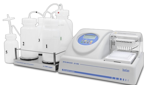
3D-IW8 BS-060102-AAI Inteliwasher