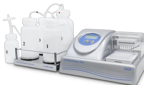
IW-8 BS-060106-AAI Intelispeed washer